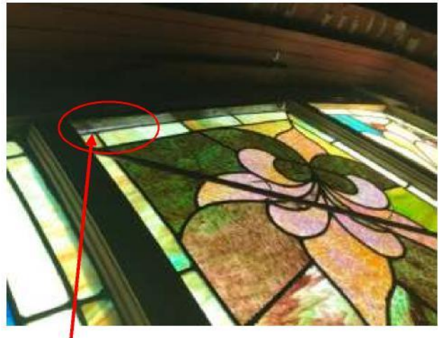
Gap between glass and frame

Please consider pledging a regular gift to the stained-glass window project or sponsoring the total cost of restoring a window. A memorial plaque recognizing the sponsor of the window will be added if desired. Please let David Jay (937) 698-6412 know which window you want to sponsor. The list and cost of each window restoration is: