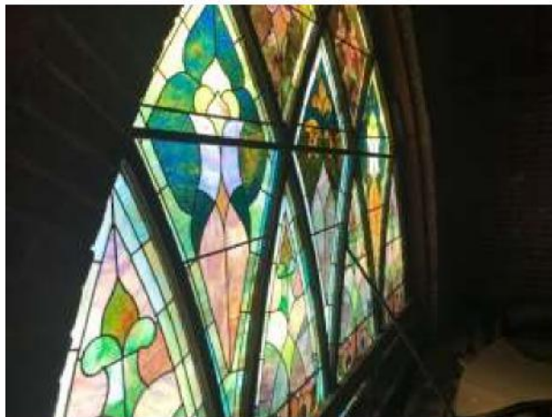
Large East Window

Update: So far, 31% ($33,575 of $109,430 total project costs) has been donated to the stained-glass window restoration fund. The trustees asked the church board to approve a capital fund drive to obtain pledges for 50% of the project cost before proceeding with the restoration.